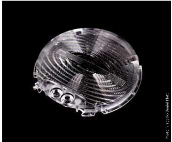
Optics for a high-end photo flash unit made of high-temperature plastic.