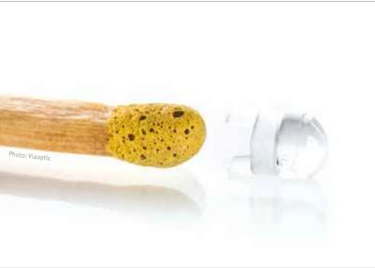
Miniature optics made of plastic: The smaller the more difficult is the manufacture of glass lenses.

glass-plastic combination will be used again," reports Bernhard Willnauer. "Mineral glasses simply offer more possibilities in imaging optics in terms of refractive index, dispersion and temperature range. But since glass cannot be ground into aspherical lenses on the scale of mobile phone lenses, a lot of research and development is currently being invested in pressing the smallest lenses".